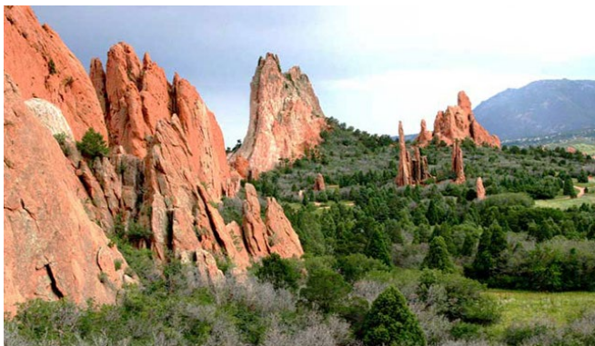
("Garden of the Gods," 2021, via gardenofgods.com)

As a reminder, the deadline to submit proposals for the 2022 Teaching Family Science (TFS) conference is January 15 th , 2022! The 2022 TFS Conference will be held from June 13-14, 2022 in Colorado Springs, CO, with a focus on "Supporting the Holistic Student." Conference co-chairs Silvia Bartolic, PhD, and Jennifer Reinke, PhD, are seeking proposals that address how educators can effectively support students' holistic lives in and out of the classroom and how principles of diversity, equity, and inclusion can be used to inform best practices in this area. Reservations at the conference hotel, Great Wolf Lodge – Colorado Springs, are now open; please book early as we have a limited number of rooms available at the conference rate. More information about the call for proposals, conference registration cost, and accommodations can be found here .